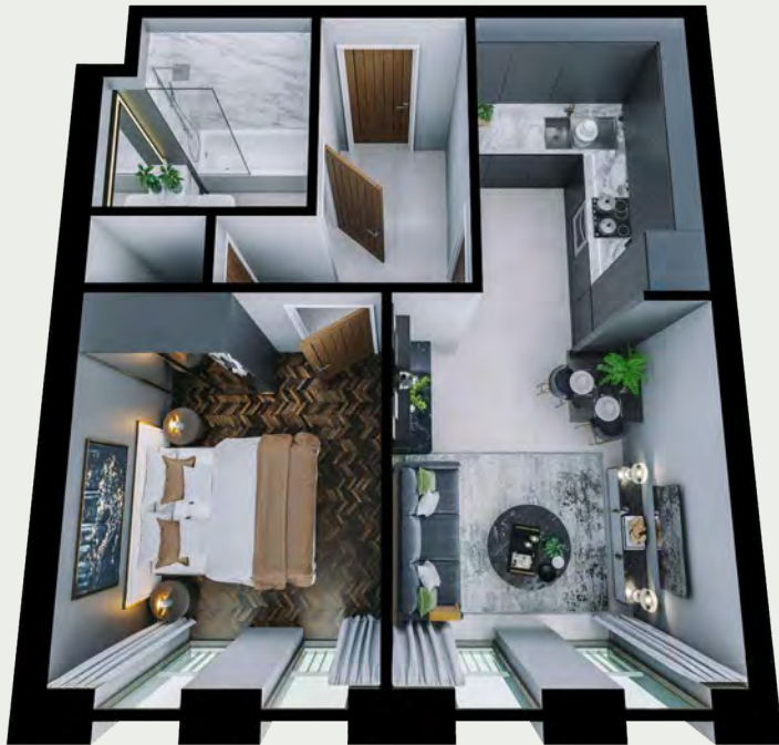
ONE BEDROOM APARTMENT